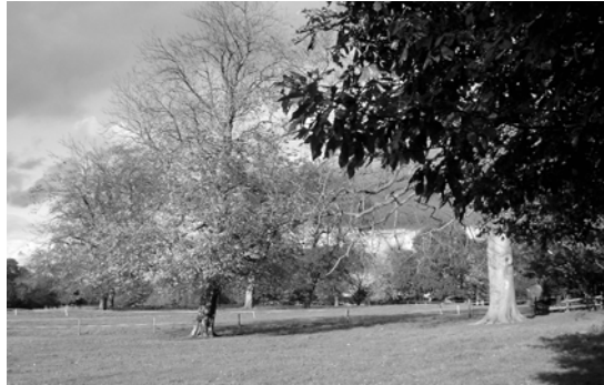
Remains of Ince Park