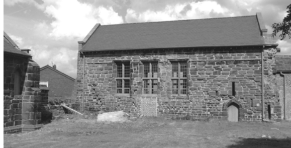
Ince Manor Great Hall

properties in this area are linked by informal tracks which contribute to the rural atmosphere of this part of the village.