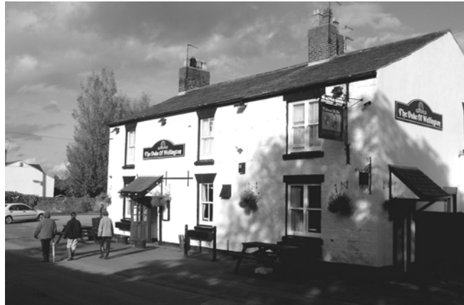
Duke of Wellington Inn

side of the Hall. Part of the ditch lies under Marsh Lane, which indicates that the lane was later than the ditch. Marsh Lane was