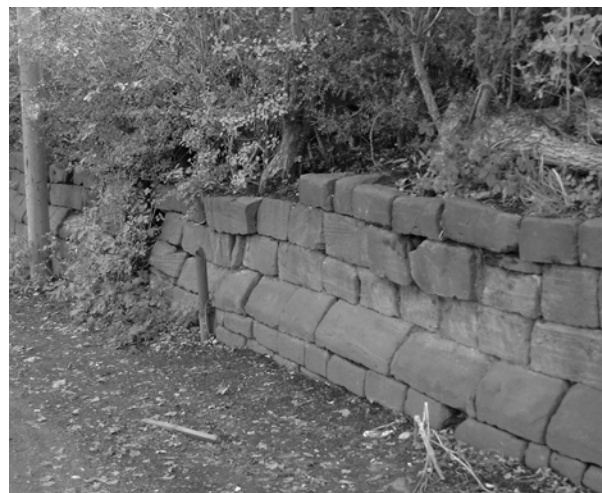
Medieval walls on Kinseys Lane