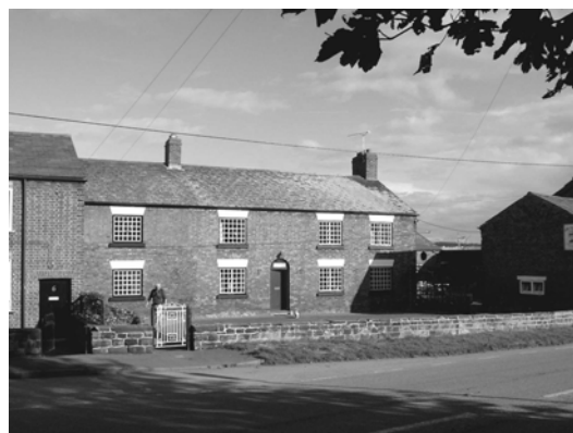
Lower Green Farmhouse

4.8 Character Zone E: Station Road: On the southern side of Station Road can be found predominately post war semi-detached ribbon development, which makes no contribution to the historic character of the village. This housing occupies the site of the Victorian vicarage. On the northern side of the road is a complex of