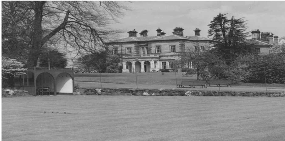
Ince Hall, demolished 1960