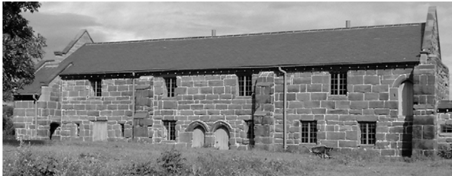
Ince Manor, Monastery Cottages